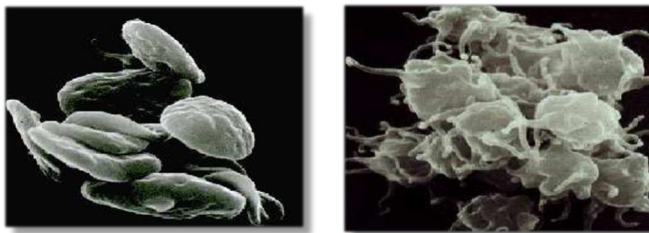
Figure 2. SEM images of unactivated platelets (left) and activated platelets (right)

The process that forms PRF, begins with the simultaneous activation of platelets (Figure 2.) and conversion of soluble fibrinogen into fibrin. This cascade begins after endothelial injury when blood comes into contact with molecules such as collagen and Von Willebrand's factor. The fibrin is organized in three-dimensions (Figure 3.) providing strength and elasticity to the matrix. This fibrin network is also able to entrap growth factors and act as a scaffold for cellular migration.